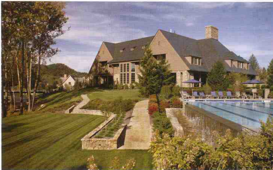
At the Greenbrier Sporting Club, homeowners have access to a number of golf courses (top), as well as the clubhouse (above).

stream, shooting sporting clays, relaxing in an Eastern-inspired spa, skiing or snowshoeing, whitewater rafting or simply exploring the abundant natural habitat surrounding your home. At the end of the day a refreshing visit to the Sports Complex or a relaxing meal in the member's lodge awaits.