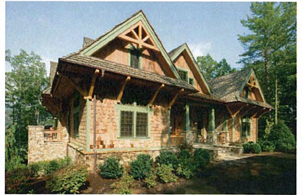
Hillerson Residence Traveller's Hill - Lot 14 7,818 G.S.F.