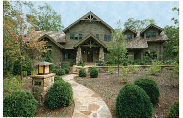
Smith Residence - Buchanan Ridge - Lot 75 5,331 G.S.F