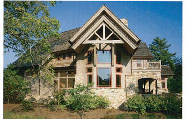
The Snead Cottages - Lot 34 3,980 G.S.F.